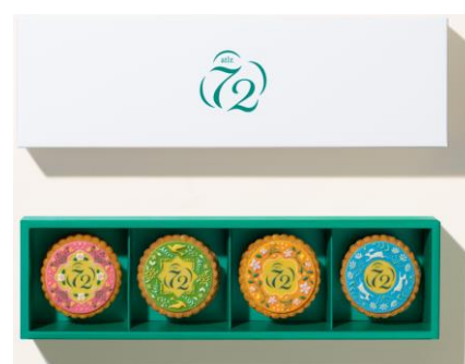
Atlr.72™ Flowering Mooncake [Gift Box] 75.00 SGD

Ajinomoto Co. provide the completely new type of mooncakes, "Atlr.72™ Flowering Mooncake" which are cookie sandwich-style mooncakes made with guimauve* 2 in four autumnal flavors (Japanese Yuzu, Kyoto Uji Matcha, Raspberry, and Blackcurrant) sandwiched in cookies decorated with gorgeous Peranakan* 3 patterns. As a food product, it must taste good, look good, and be reasonably priced, so these were put first in creating our product. The recipe is supervised by a famous patissier who was in charge of sweets at the banquet when the leaders of various countries visited Japan, and the detailed design on the top surface is handmade one by one by craftsmen. Adding to that, Ajinomoto Co. uses healthy and environmentally conscious ingredients, such as a protein called "Solein®"* 4 which is produced from carbon dioxide, because Ajinomoto Co. believes that when people give a gift to a loved one, it is better to wish that person's future happiness as well, which creates a warm human connection.