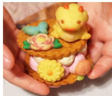
Mooncake Workshop for Kids 54.50 SGD

Atlr.72™ by Ajinomoto Co., Inc. ("Ajinomoto Co.") will offer the event as "Mooncake Workshop for Kids" with opening new pop-up store at One Holland Village from August 30. This is a workshop for kids where they will decorate one of a kind mooncake as a gift for family members or someone special.