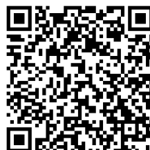
Mooncake Workshop for Kids