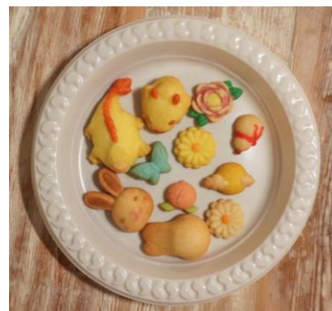
8 kinds of 3D cookies

At the store, customers can also buy "Atr.72™ Ice Cream Sandwich", cookie sandwiches with vanilla ice cream and mochi (rice cake). To celebrate the opening of the new pop-up store at One Holland Village, for the first three days, Ajinomoto Co. will offer a redemption coupon for an Ice Cream Sandwich only for shop Far East App members (*first 100 people per day). Other visitors can also get one for free by following our official Instagram (*first 100 people per day). As special offer for purchasers, if they buy 1 Flowering Mooncake [Gift Box], they can get 1 free Ice Cream Sandwich (8/30-9/8). Visitors can also receive a brand's original fan using the top design of Ice Cream Sandwich (while stocks last). Other promotions will also be offered, so please check the brand's official Instagram for details.